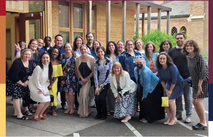
Nativity's Staff and Faculty at graduation