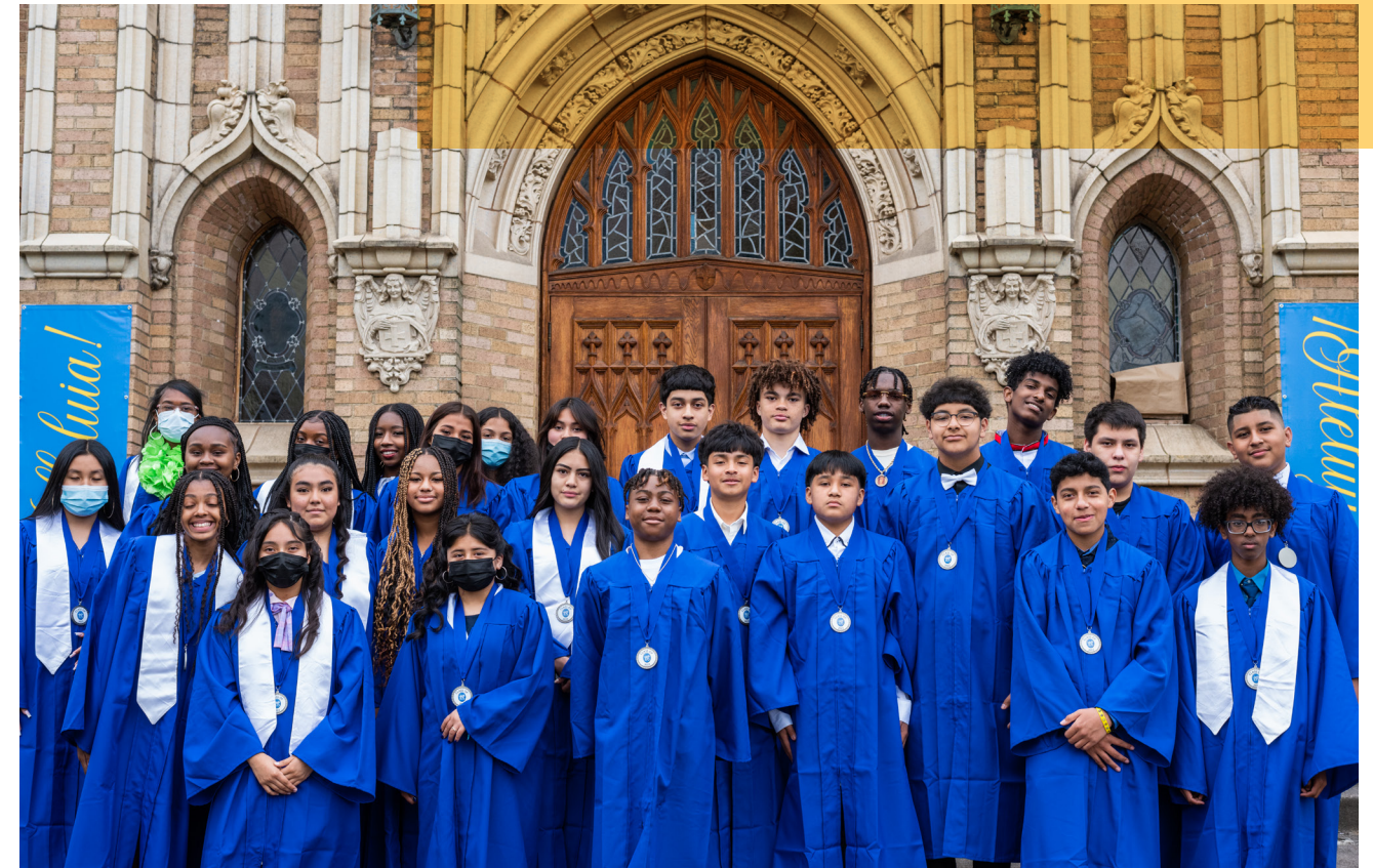
Nativity's graduating class of 2022

The Graduate Support Program is always evolving to serve our growing alumni population. In 2021-22 there were over 370 graduates attending high school, college, graduate school, or working. Throughout each transition, graduate support is there as a resource to provide guidance and mentorship.