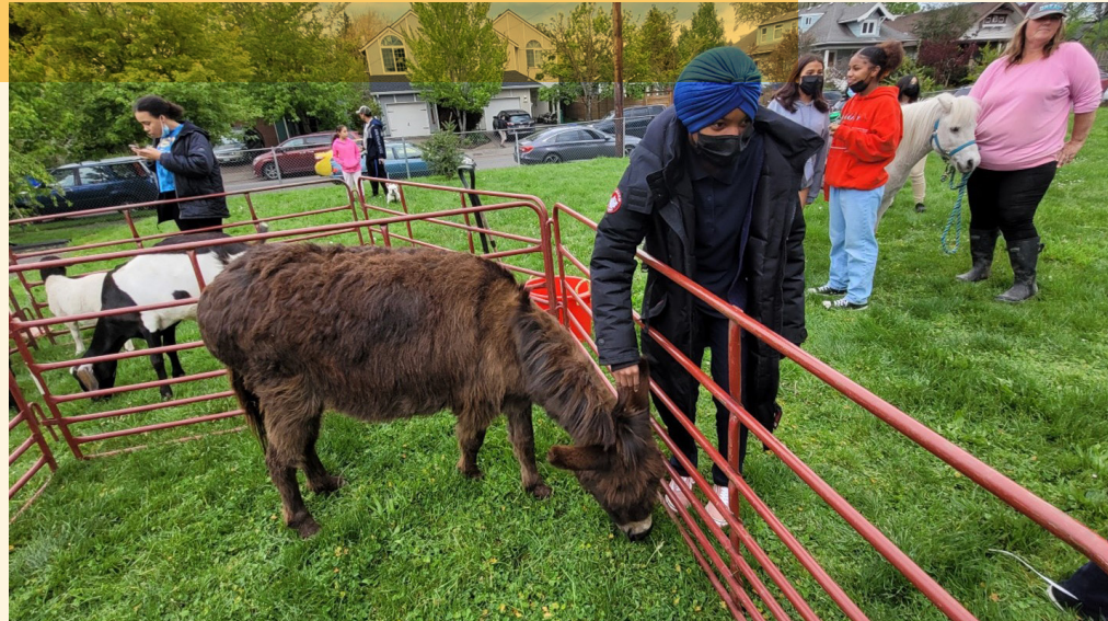
Students and their families experienced a petting zoo at our family day, Spring 2021

The past two years brought unthinkable hardship to Nativity students, their families, staff, and beyond. From economic devastation to racial injustice to a global pandemic that upended the learning experience for so many – the whole community needed extra support. Nativity answered that call by continuing our vital stream of wrap-around services, facilitated by our Family Partnership Coordinator. This liaison and connective channel to our family community is one of the many things that make Nativity the unique environment that it is, creating life-long bonds with the families we serve.